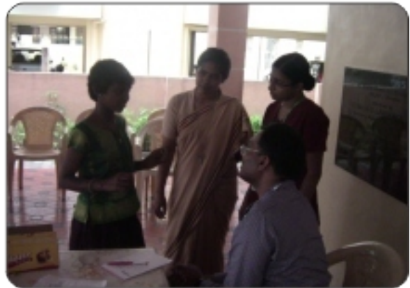
Free Health check up for children in an orphanage