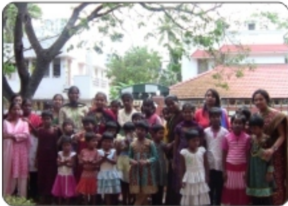
"Save the Girl Child" – Dinner with girl children in an orphanage