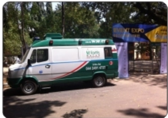
"Chennai Cycling 2013" – Health Partners to an event that promotes cycling as a Healthy lifestyle and environment friendly option