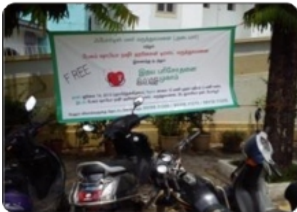
Free Cardiac Screening Camp held for poor patients